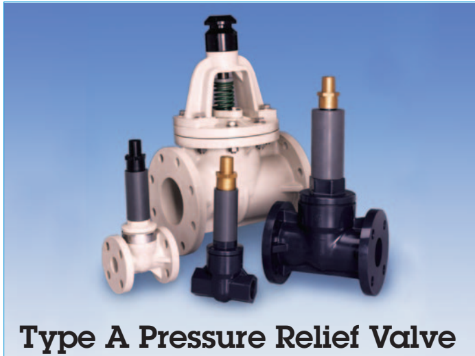
Type A Pressure Relief Valve