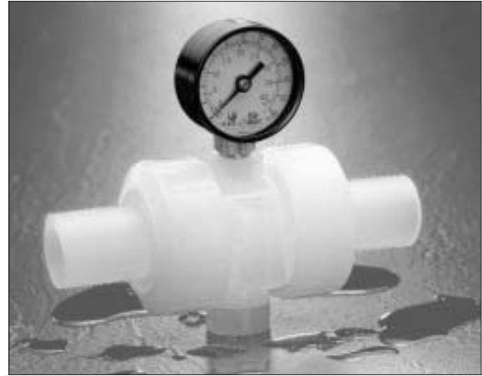
GGMU above, shown with Schedule 80 male spigot ends for fusion (Code C3 below) and standard 2" gauge.

Note: 1/4" NPT instrument connection is standard on all Ultra-Pure gauge guards. For other size requirements consult factory.