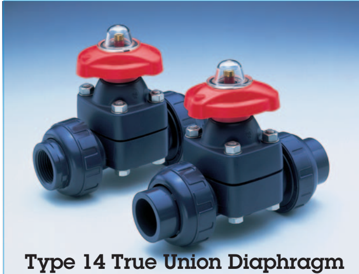
Type 14 True Union Diaphragm