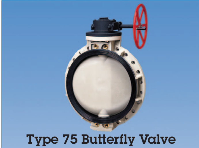
Type 75 Butterfly Valve