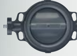
Standard Lug-type butterfly valve/ end installation Type 568