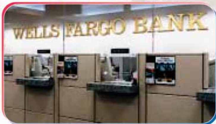
Polycast crystal-clarity provides a beautiful environment that makes customers feel safe, not confined.

Polycast is easy and inexpensive to install and provides superior protection anywhere money changes hands or valuables are on display.