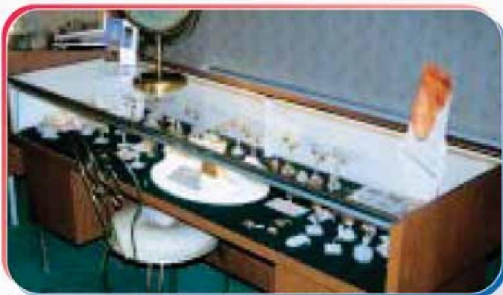
Polycast also provides high-impact resistance that foils "smash-and-grab" thieves.