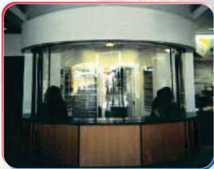
Because Polycast sheet can be easily cut, drilled, and curved, it can be formed to almost any shape. Because it's so light, it can be configured as a free-standing wall.